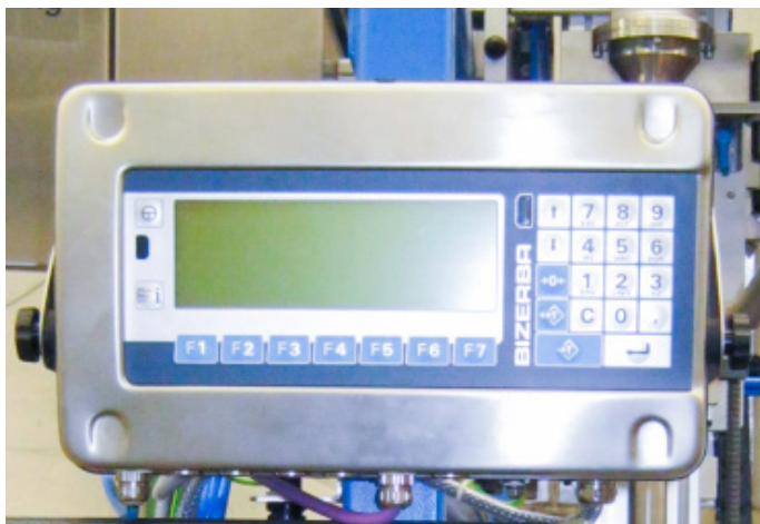
Discontinued Bizerba ST

The discontinued Bizerba ST, Bizerba ITE, Bizerba ITU, and Velotronik HS4 display must be replaced to ensure the future operational capability of your system. Replacement devices are no longer available. GREIF-VELOX offers customized retrofit solutions for this purpose.